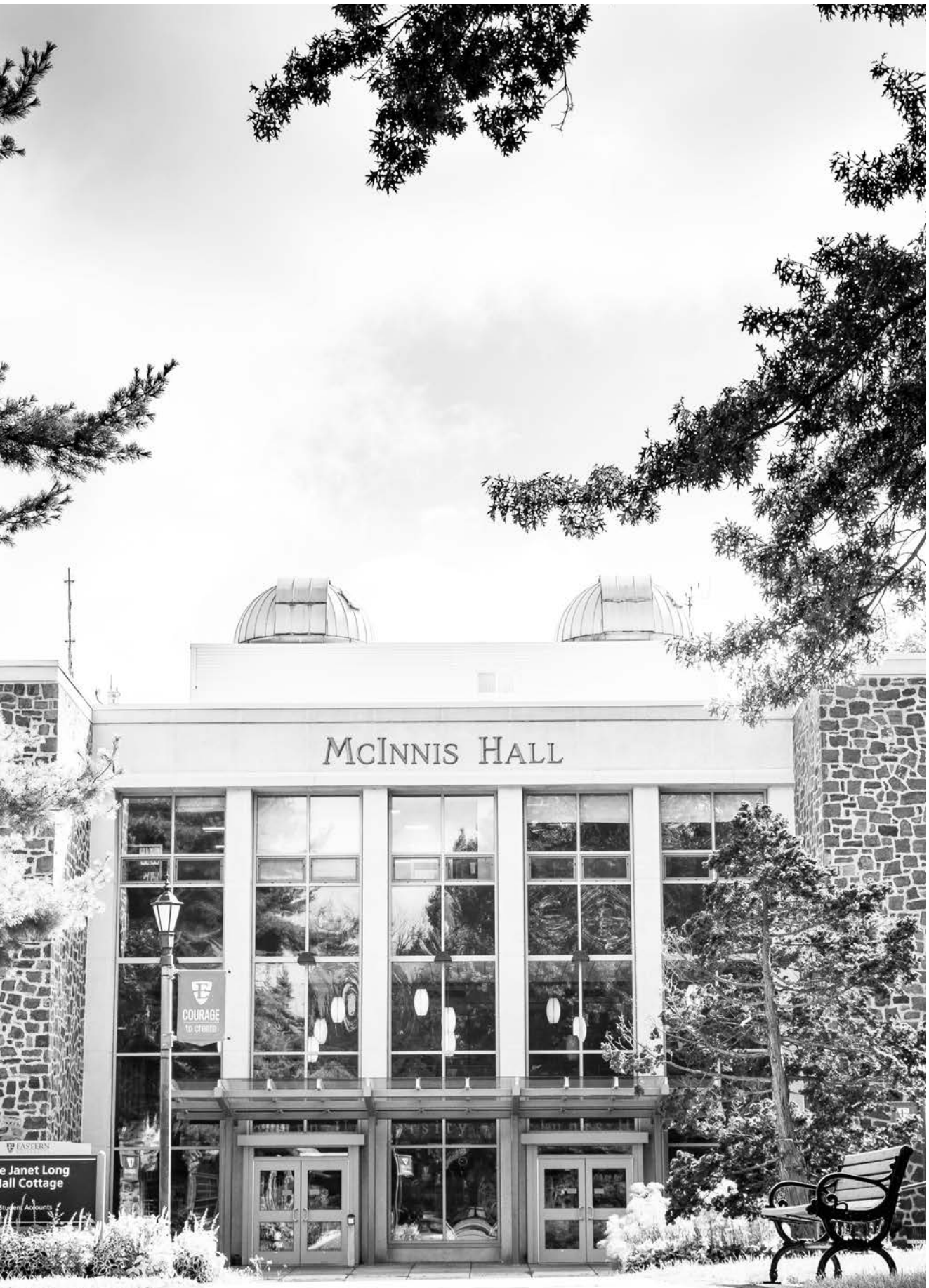
2019/2020 ACADEMIC CATALOG