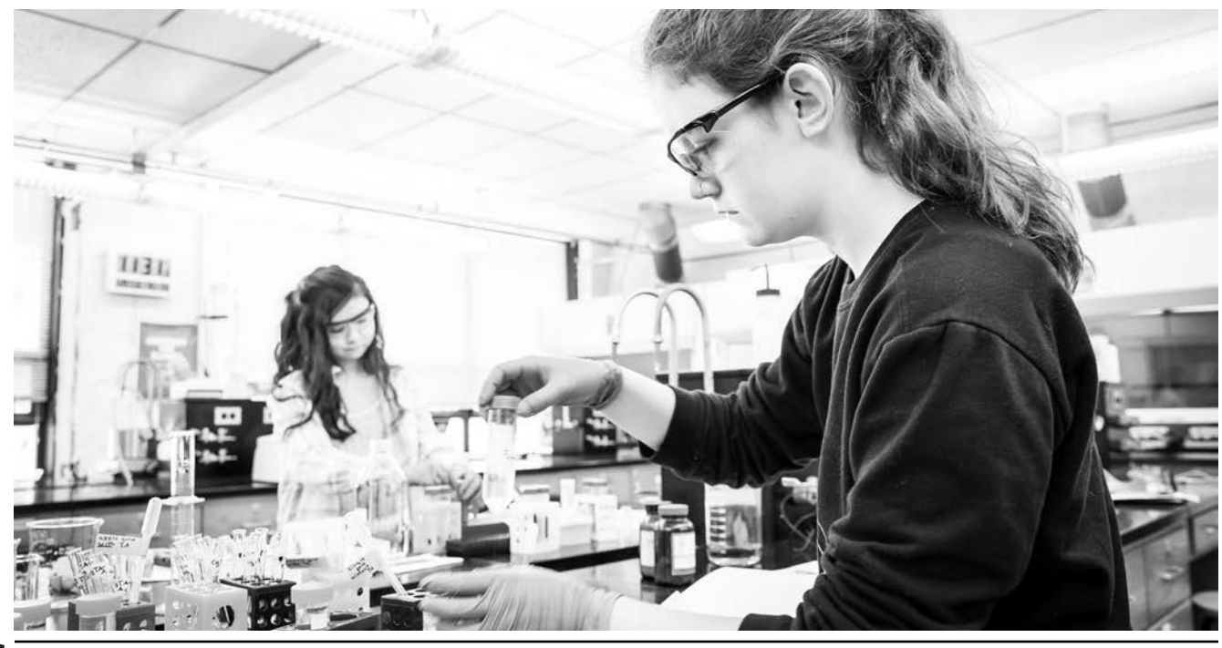
2019/2020 ACADEMIC CATALOG

The content of this seminar-style course provides an overview of the chemical and business aspects of the chemical industry. Topics include the history of the chemical industry; sources of chemical feedstocks; the role of R & D and chemical engineering; patents and trade secrets; scale up and production; environmental and safety regulations; economic factors; marketing and sales; global trends. Both bulk and specialty chemicals will be considered. Current events and case studies will be emphasized and a plant tour may also be part of the course. A series of speakers from the industry will give seminars. Three hours