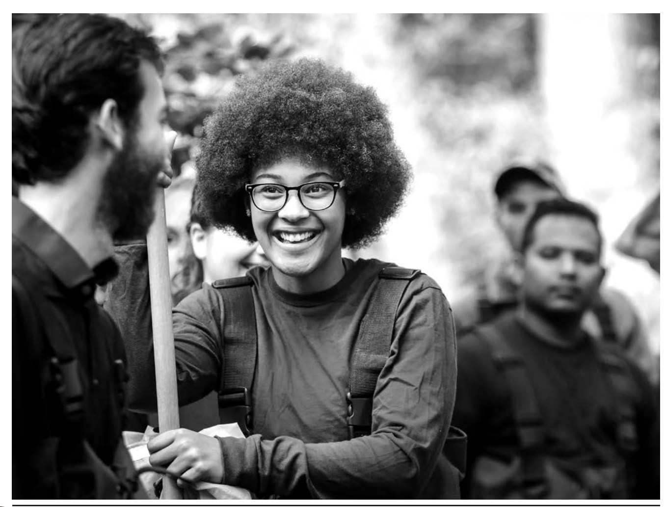
2019/2020 ACADEMIC CATALOG

A course designed to prepare the Worship Arts major to develop a clear theology of worship and philosophy in addition to approaching the varied tasks associated with music leadership.