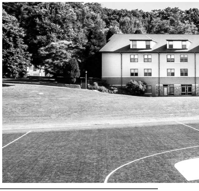
2019/2020 ACADEMIC CATALOG

Language both reflects and shapes human culture and human thought. Because of this, studying a language other than one's native language helps students better understand how reality can be interpreted and expressed in significantly different ways. All Templeton students are required to demonstrate the ability to communicate in a language other than their native language at a novice high level or higher (by successfully completing a 102-level or higher course in a chosen language).