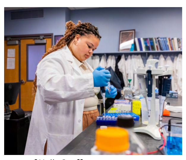
above two photos courtesy of Holly Scoffone