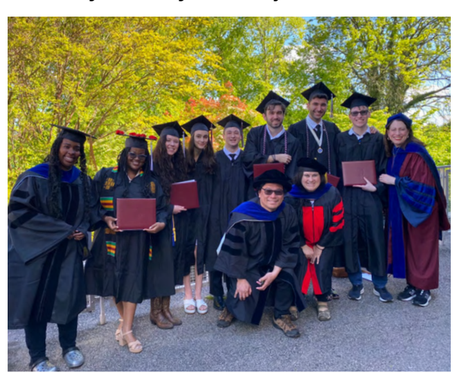
The whole crew