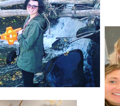
Who's the new student?