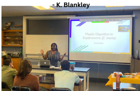
The Digestion of Plastics by Superworms - A. Hawkins