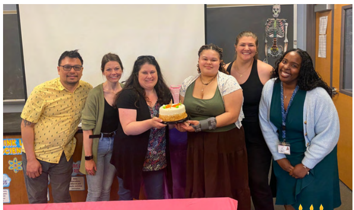
In the biology department, everyday is cake-day!