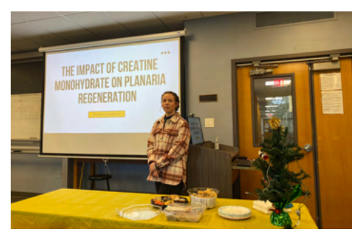
The Impact of Creatine Monohydrate Supplementation and Timing on Planaria Regeneration