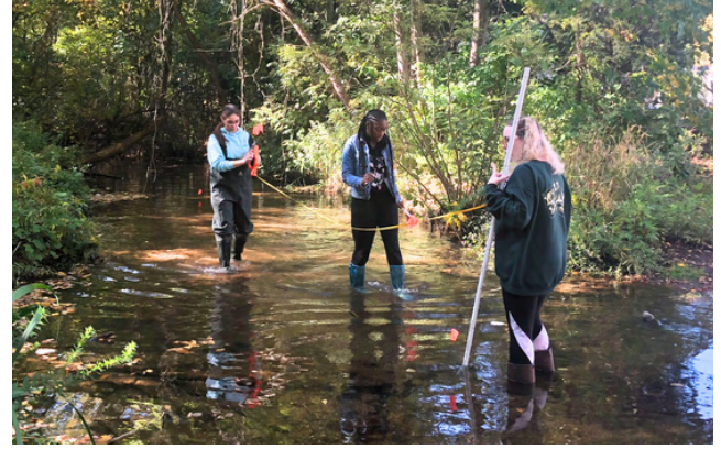
Lots of measuring