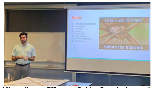
Microclimate Effect on Spider Population and Distribution -R. Porter