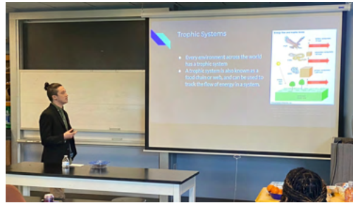
Importance of Isopods in Breakdown of Detritus in Temperate Environments- B. Chung