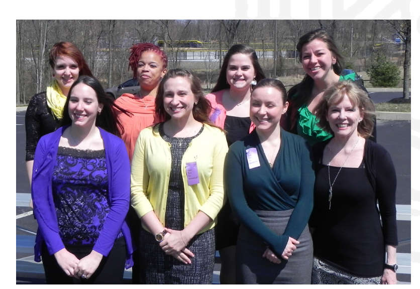
2013 Inductees and faculty